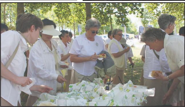
Sandwiches were lovingly prepared by our Sisters for lunch in parks, or near shrines that we were visiting.