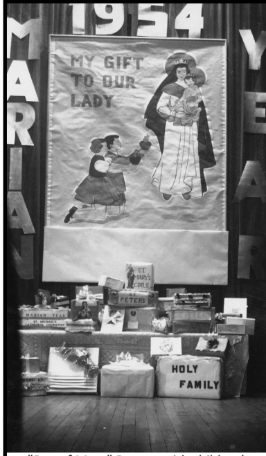
"Day of Mary" Banner with children's good deed boxes on the stage